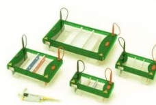
Horizontal Electrophoresis systems