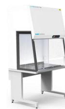
NEW! MARS Silent Laminar Flow Cabinet