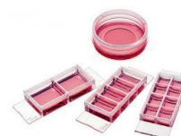
Small Scale Cell Culture Dishes