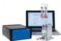
Pump Systems For Vascular Flow Applications

Thistle Scientific are the appointed UK distributor for several established brands including Axigen, Biometra, Ibidi, LaboGene, Nichiryo and UVItec. Through our suppliers, we provide an ever expanding range of quality products to complement your research. And through our sister company Web Scientific we offer one of the largest ranges of electrophoresis systems, spares and accessories you'll find anywhere as well as a diverse range of PCR reagents, specialist labels and all the products required for protein analysis, from protein sample preparation to purification to Western Blotting.