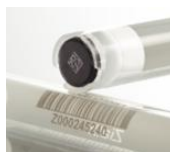
1 and 2D Bar Coded Tubes