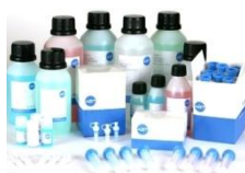
Resins For Protein Purification