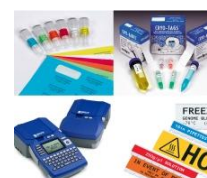
Labels & Printers

Thistle Scientific, DFDS House, Goldie Road, Uddingston, Glasgow, G71 6NZ.