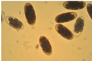
Fig.1. Nematode eggs before homogenization