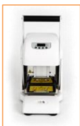
VTS Variable Temperature Sealer V902001